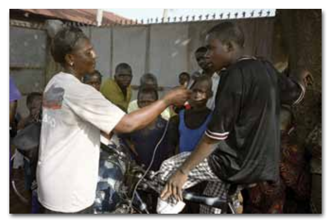
Filming a person-on-the-street interview, Video Sabou et Nafa project (2002, Guinea,)

Participatory media has deep roots in Latin America. In the 1950s and 1960s, miners in Bolivia aired local-language radio programs about their daily lives and needs. Since that time, many communities in the region have voiced their concerns through what came to be known as alternative or "citizen's" media