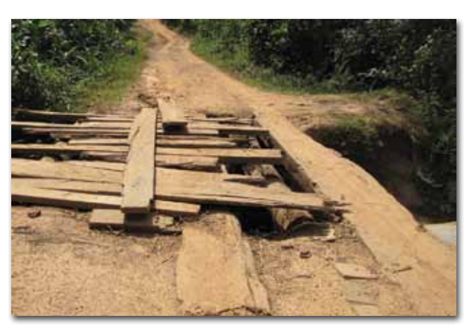
One of many logistical challenges in delivering humanitarian supplies to camps on the Cote d'Ivoire-Liberian border (2011).

Everyone who lives and works in a crisis-affected setting—field staff, trainers, participants, and other community members—is coping with extremely stressful conditions. People are concerned with basic needs. Participants and staff will have many other responsibilities outside of their project roles. It may be difficult at times to maintain continuity in training sessions or field activities. Facilitators, program personnel, and participants should recognize that they are doing the best they can under difficult circumstances, and value what they have been able to achieve.