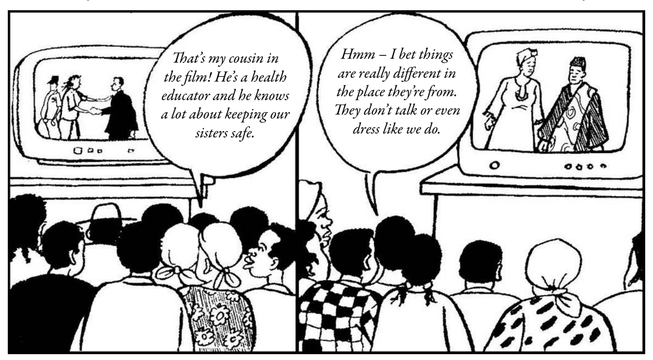
Drawing by Augustine Cholopoly (Liberia)

These steps can vary depending on project goals and timelines. In some cases, filming a video may follow a series of camera exercises; in others, training may continue for several days before production planning begins. In projects designed to foster self-expression and confidence (such projects among people with disabilities), identifying audiences may be a lesser consideration. For advocacy work or promoting changes in attitudes or practices, identifying the key audience is a critical step. (See the accompanying manual, A Practical Guide to Community Video Training, Days 7-9.)